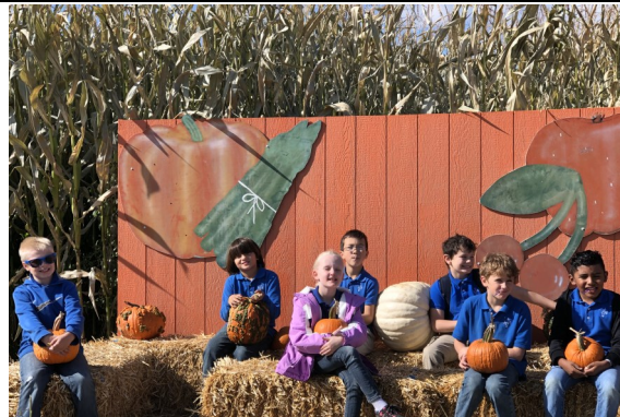
Pumpkin Patch Field Trip - PreK-8th Grade